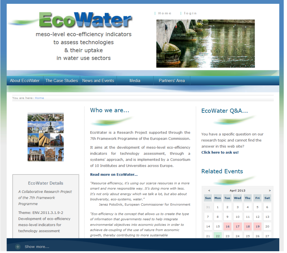
Figure 1. The EcoWater welcome screen