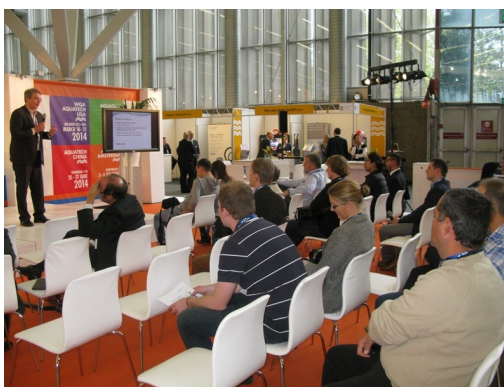
AquaTech participants at one of the EcoWater AquaStages

The AquaTech exhibition, a large-scale exhibition of water technologies and part of the International Water Week, was the selected venue for the 2 nd Large-Scale Targeted event of the EcoWater project that took place in Amsterdam (5-7 November 2013) with the aim to develop operational science-industry links.