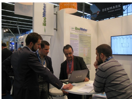
Demonstration of the tools and Toolbox at the EcoWater Booth

At the AquaStages, visitors and as exhibitors were informed about the EcoWater concepts and the availability of the EcoWater tools and toolbox. They also had the opportunity to see an example of the project's applicability on the dairy industry case study.