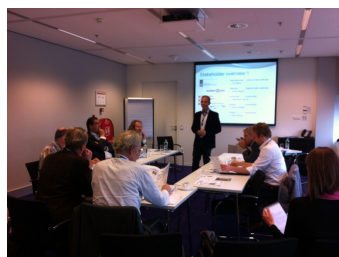
Discussions among the actors during the Dutch CS Workshop

The 6 th EcoWater Case Study Workshop was held in Amsterdam on the 7 th November 2013. The event focused on the EcoWater Case Study on the Energy Production Industry. It was aimed mainly at the identification of the drivers and barriers for the uptake of new and innovative technologies in the Case Study area.