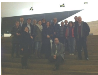
The Second EcoWater Annual Meeting Participants

The 2 nd Annual Project Meeting of EcoWater was held on November 8 th - 9 th 2013 in Amsterdam, the Netherlands, and was combined with a Project Steering Group Meeting and the Second External Advisory Board Meeting. The Annual Meeting was attended by representatives of all Project Partners and all three members of the External Advisory Board.