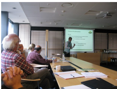
Discussion among actors during the Holstebro Workshop

The 4 th EcoWater Case Study Workshop was held in Holstebro, Denmark on the 20 th September 2013. The event focused on the eco-efficiency indicators and technologies that can be assessed in the ARLA dairy industry Case Study.